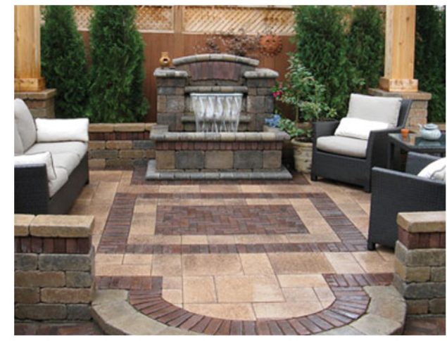
Colour combo for main solder course and pillars.