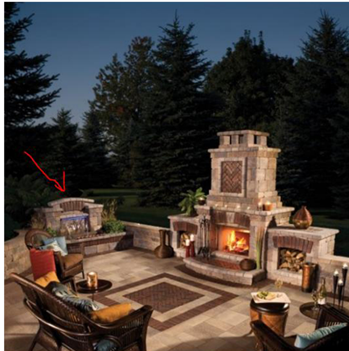
General ideal for fireplace & pavers. Fireplace kit by Unilock.