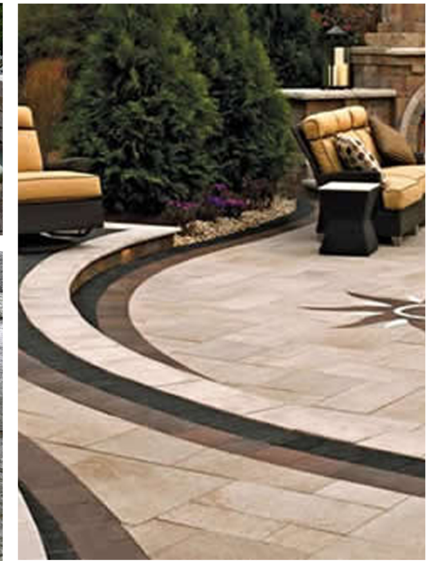
Example of charcoal contrast border.