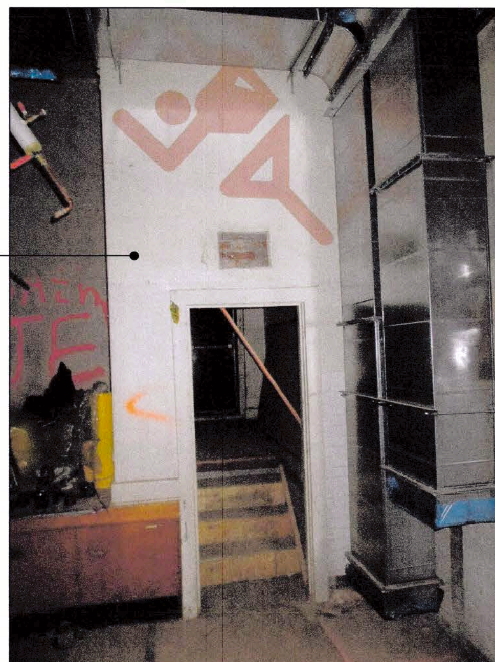
2 INTERIOR STAIRS FACING STAGE