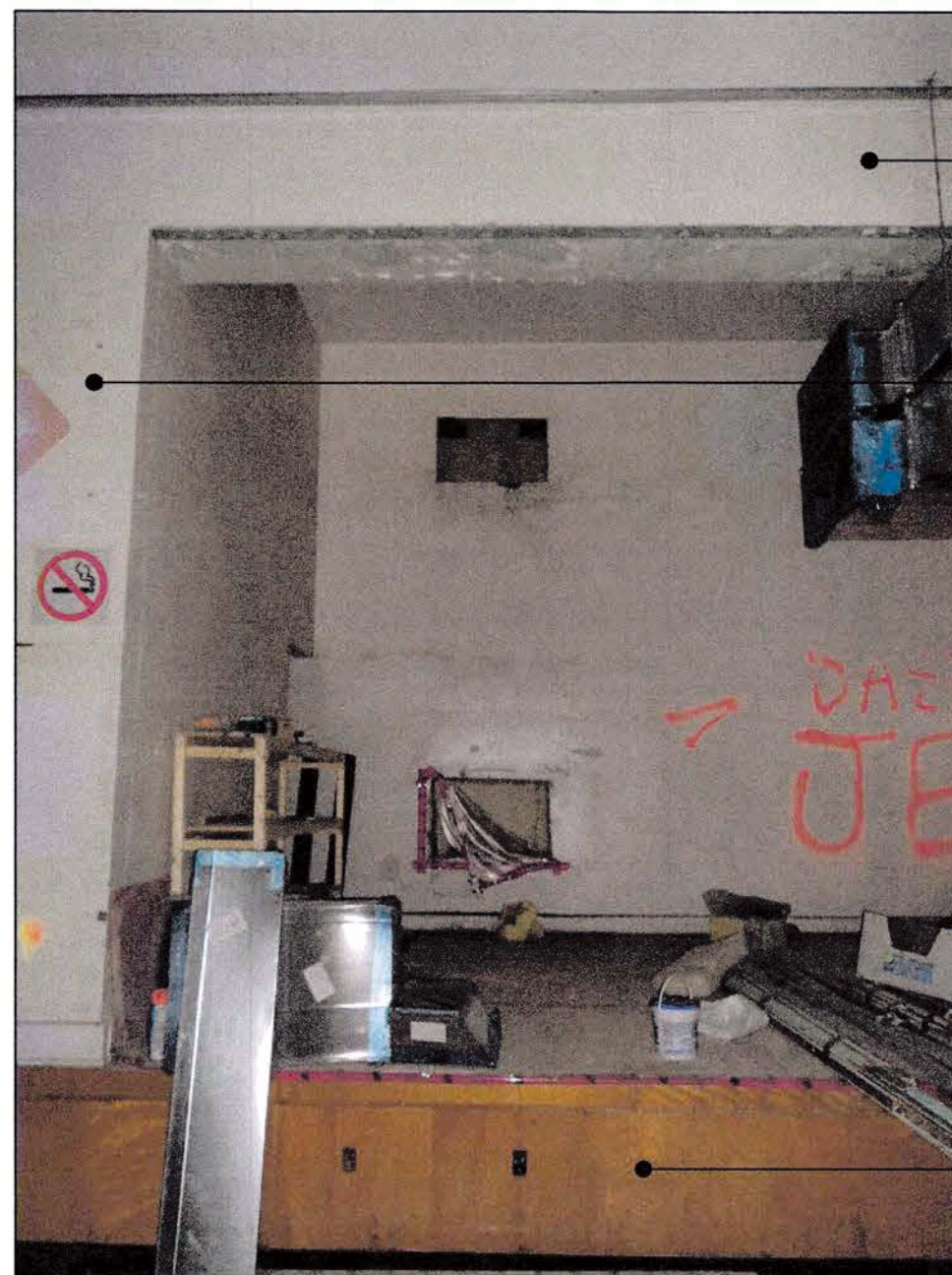
1 INTERIOR VIEW FACING STAGE