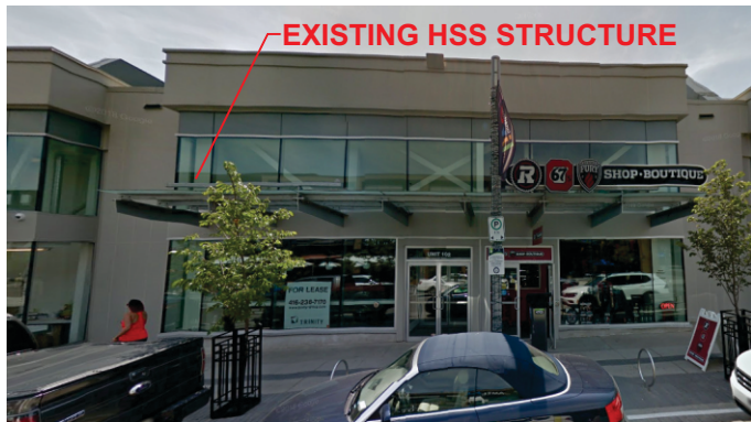
ELEVATION - EXISTING BUILDING