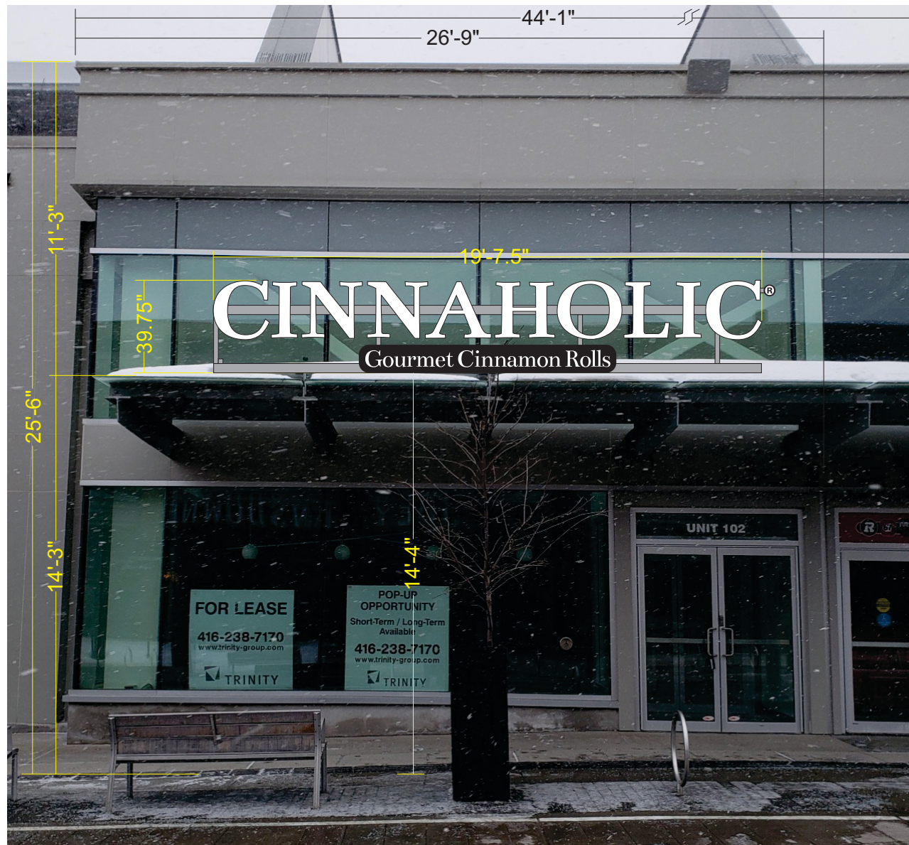
ELEVATION - EXISTING BUILDING C/W NEW SIGNAGE